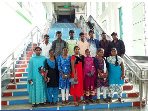
Field Visit for Cochin University