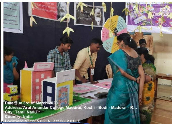
Participation in Golden Jubilee Exhibition