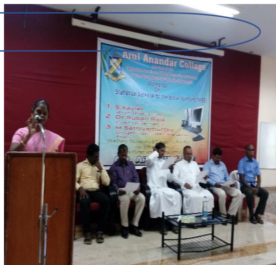
State level Work Shop on Research Methodology for Scholars