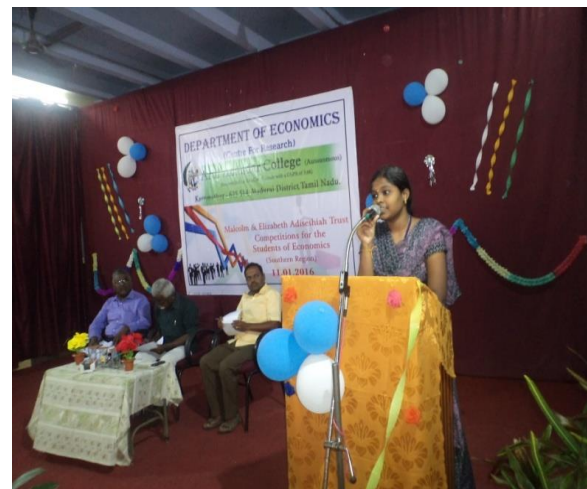
Malcolm & Elizabeth Adiseshiah Trust Competition for the Students of the Economic Southern Region