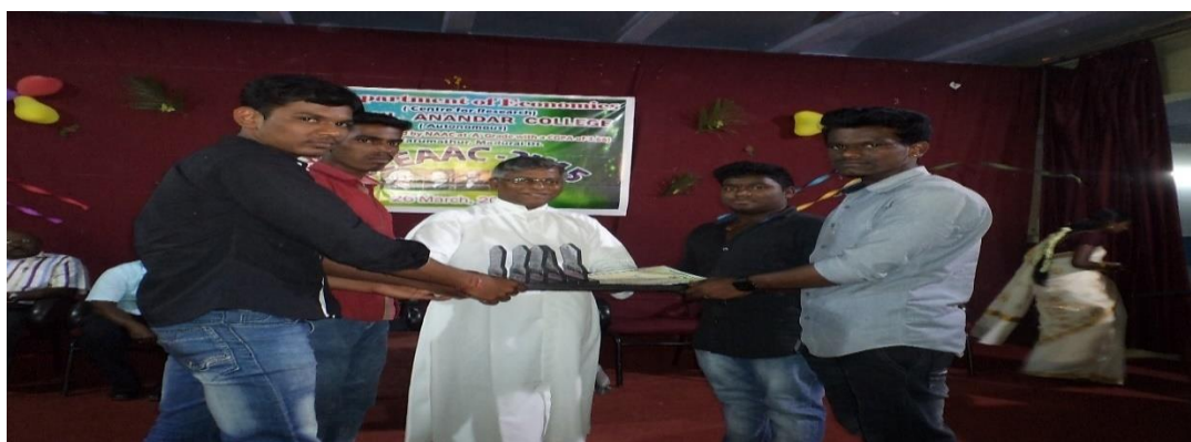
CEEAAAC - Cultural Evening of Economics of Arul Anandar College

The Department of Economics is organising a field trip for visiting eminent Universities and Libraries every year. As a part of the trip our students visited CUSAT Cochin on 1 st March 2019.