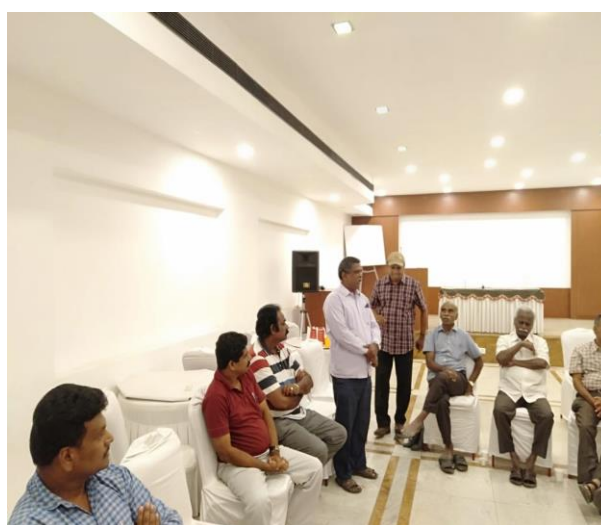
Golden Jubilee Ph.D Scholars' Meet

During the Golden Jubilee Exhibition our students created models based on 'Sustainable Development' using this opportunity they explore the achievements of the Golden Jubilee Department such as Publications, Ph.D awarded, Books authored regarding Sustainable Development.