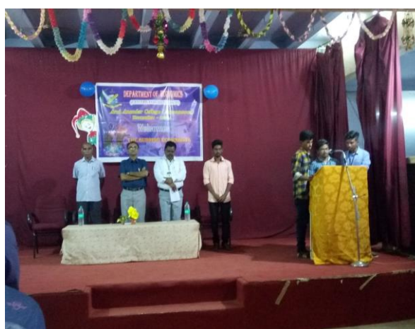
Welcome and orientation programme for I Year Students