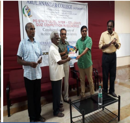
Winners of PG State Level Inter - Collegiate Quiz