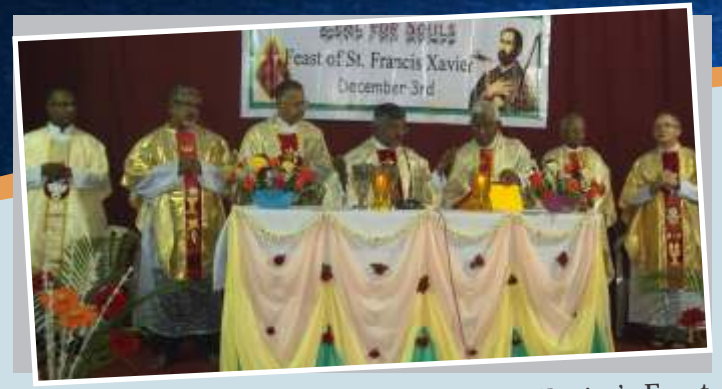
Concelebration of Holy Mass during St.Xavier's Feast