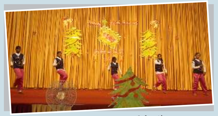
Students at Christmas Celebrations