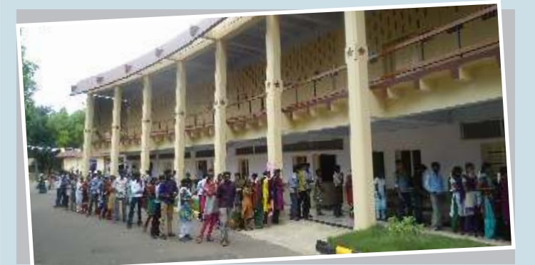
Students' Council Election