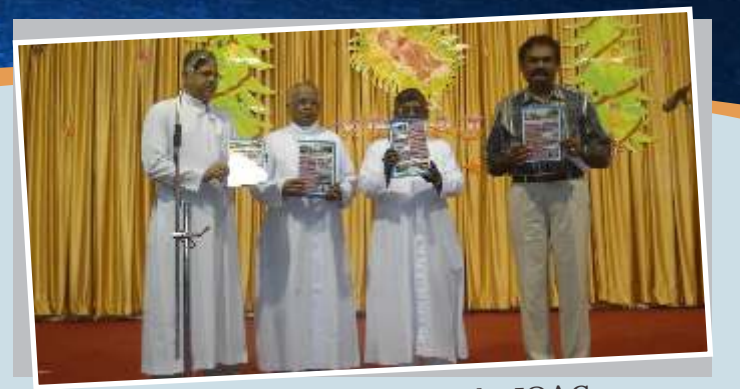
Release of 15<sup>th</sup> Newsletter of the IQAC