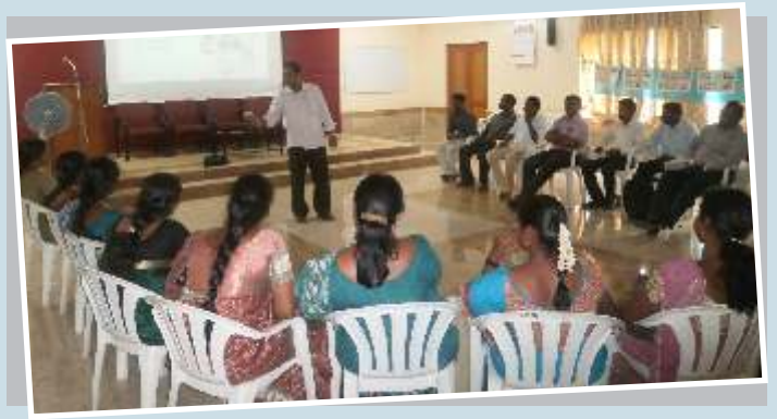
Staff at Orientation