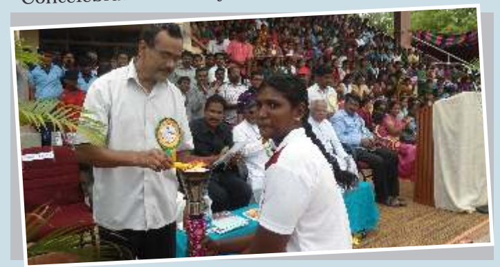
Lighting of Olympic Torch