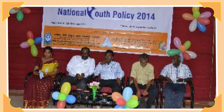
Outreach Programme by CWS