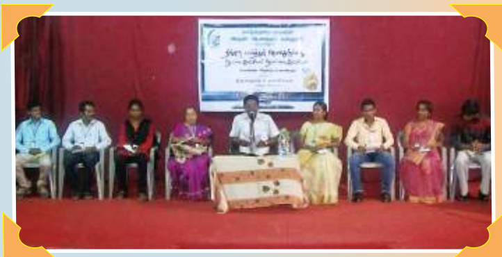
Debate in Tamil