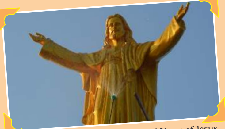
Installation of the statue of Sacred Heart of Jesus