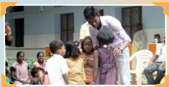
YRC students with destitute children at Alagusirai