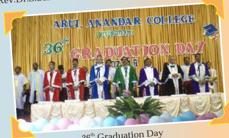
36 th Graduation Day