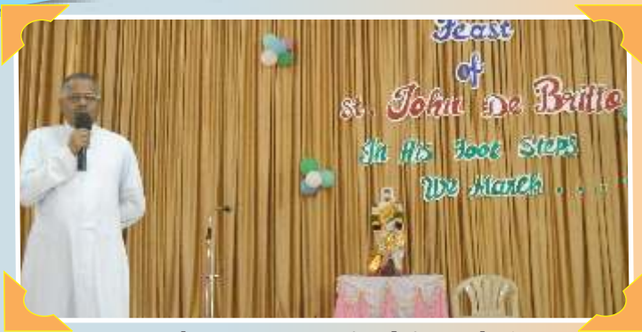
Message by Rector on Arul Anandar's Feast