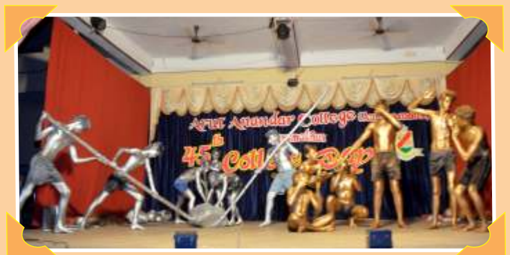
Spectacular display of students' skills