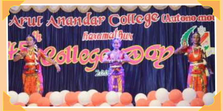
Invoking the grace of God