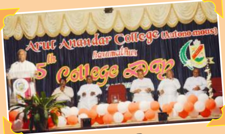
45 th College Day