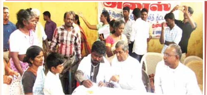
ARISE Free Health Camp