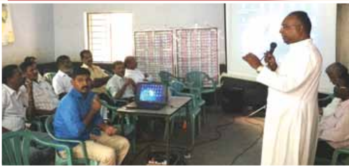
Alumni - Theni Chapter