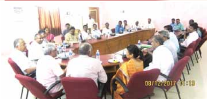
Meeting for Researchers