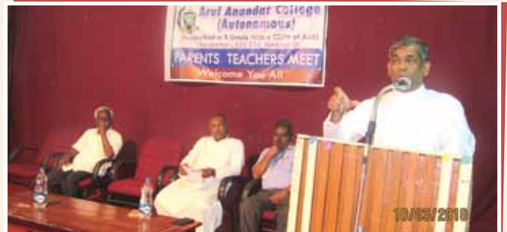
Parents Teachers Meet