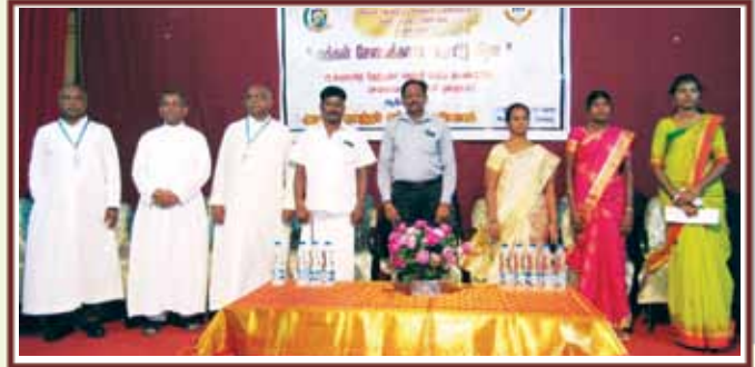
மக்கள் சேவைக்கான பாராட்டுவிழா