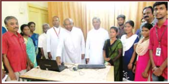
Students' Council Election