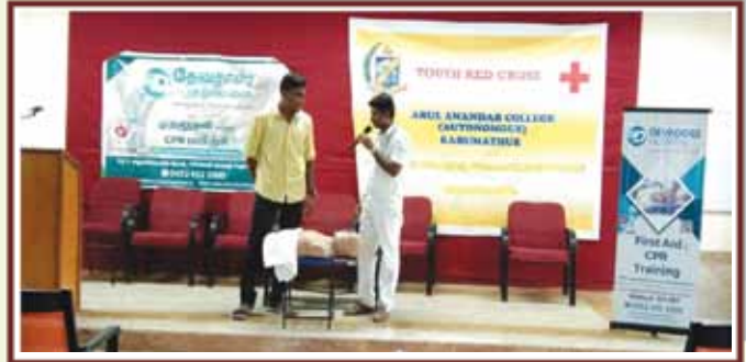
First Aid Training