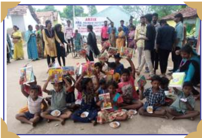
Towards Village Empowerment