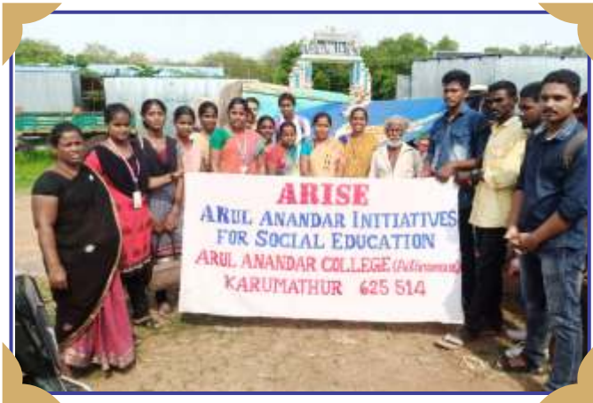
Empowerment of Marginalised