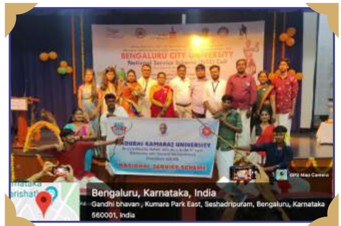
National Integration Camp - Bangalore