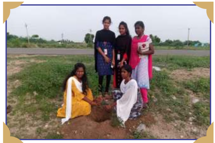
Tree Plantation at Poozaripatti