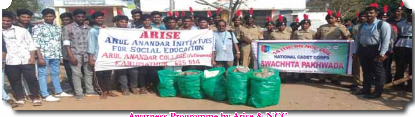
Awarness Programme by Arise & NCC