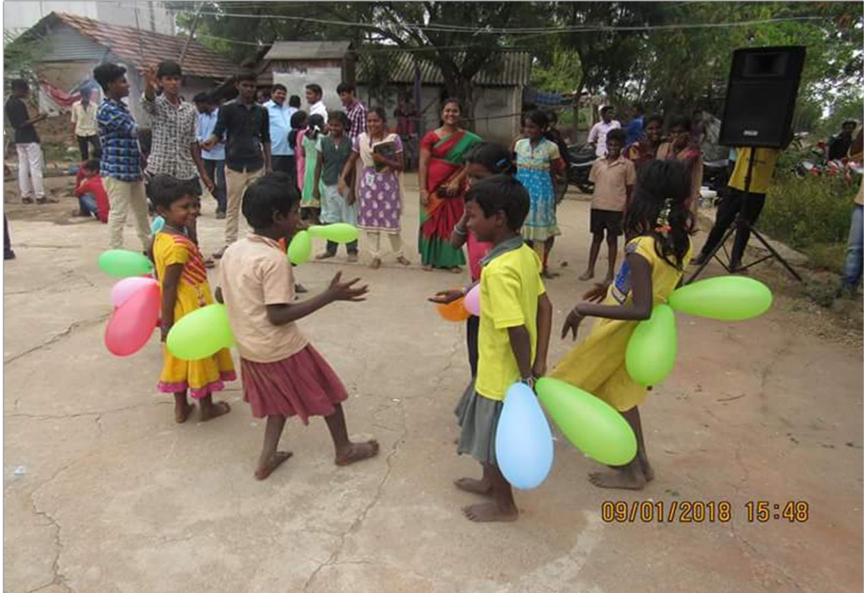
Balloon Saving Game

Balloon saving Game was conducted by our department students to the children of Jeyaraj Nagar during the celebration.