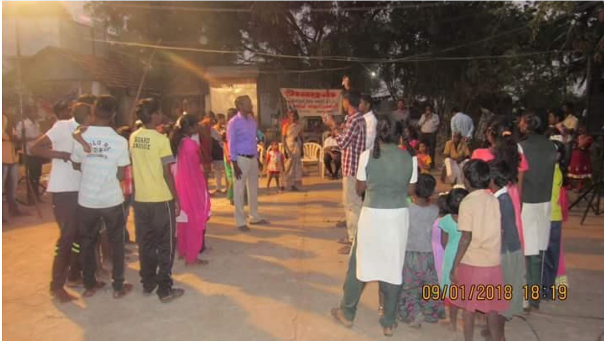
Lucky Number Game for Jeyaraj Nagar Peoples.