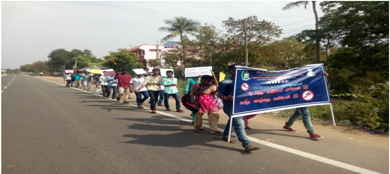
Ilyear IT&M Students on Rally