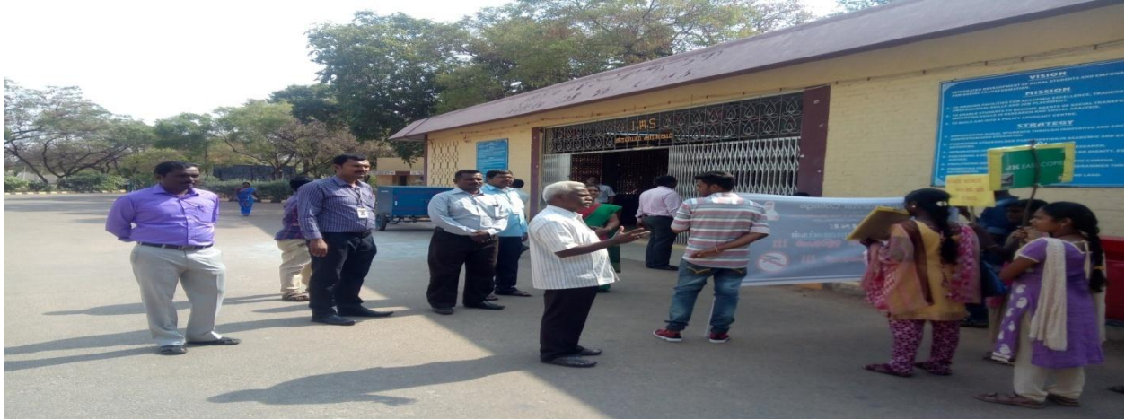
Deputy Principal Inaugurated the Rally

To create awareness about Dengue to the public the Rally was organized. Through the plug cards the students deliver the slogan about the cleanness and preventive measurements about dengue.