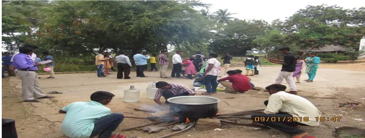
Preparation of Pongal

Along with the help of Jeyaraj Nagar peoples, faculties of the department and the students of Department of Information Technology and Management cooked Pongal.