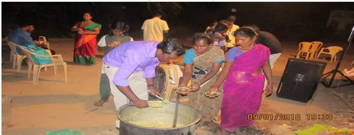
Distribution of Pongal