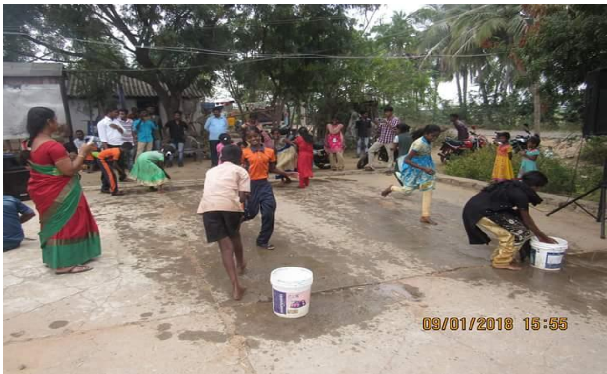
Water Filling Game

Water Filling Game was conducted by our department students to the children of Jeyaraj Nagar during the celebration.