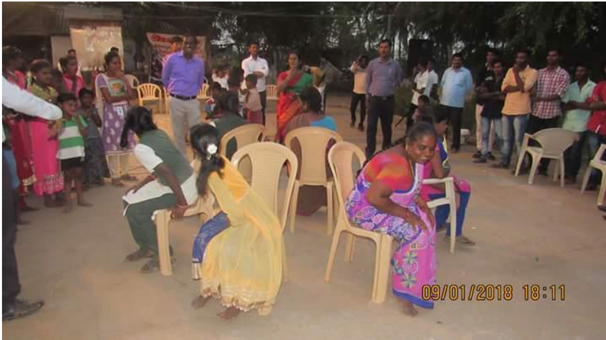
Musical chair Game for Womens

Musical ChairGame was conducted by our department students to the children of Jeyaraj Nagar during the celebration.