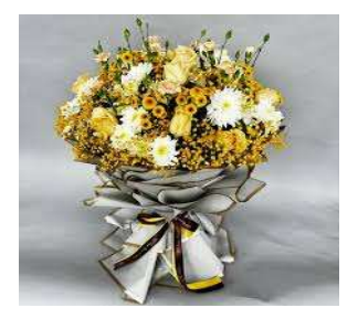
ALL ARE INVITED